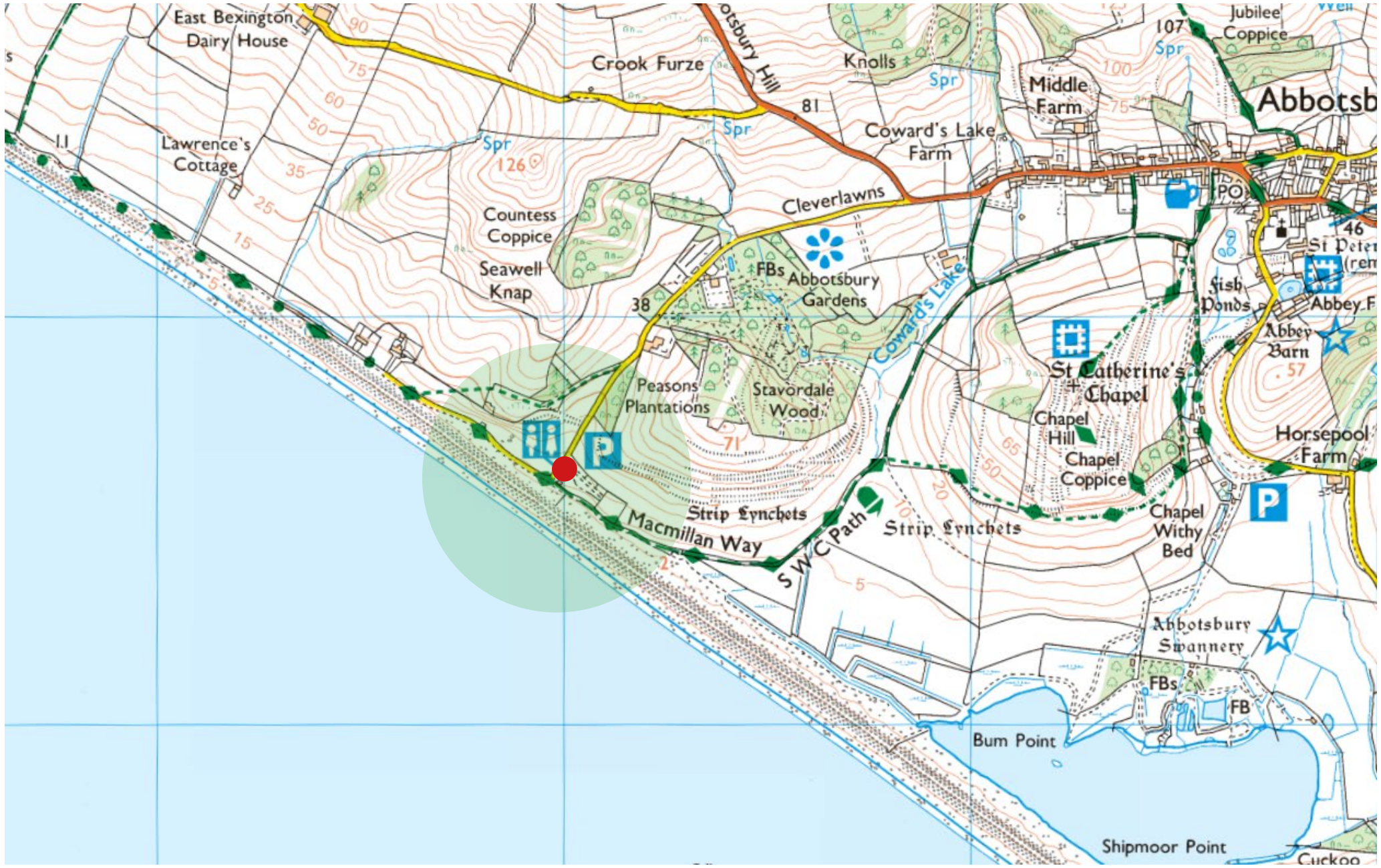
Beach Car Park at Abbotsbury DT3 4LA - Mile 13 / 151

Not signed. Only water and basic snacks available.