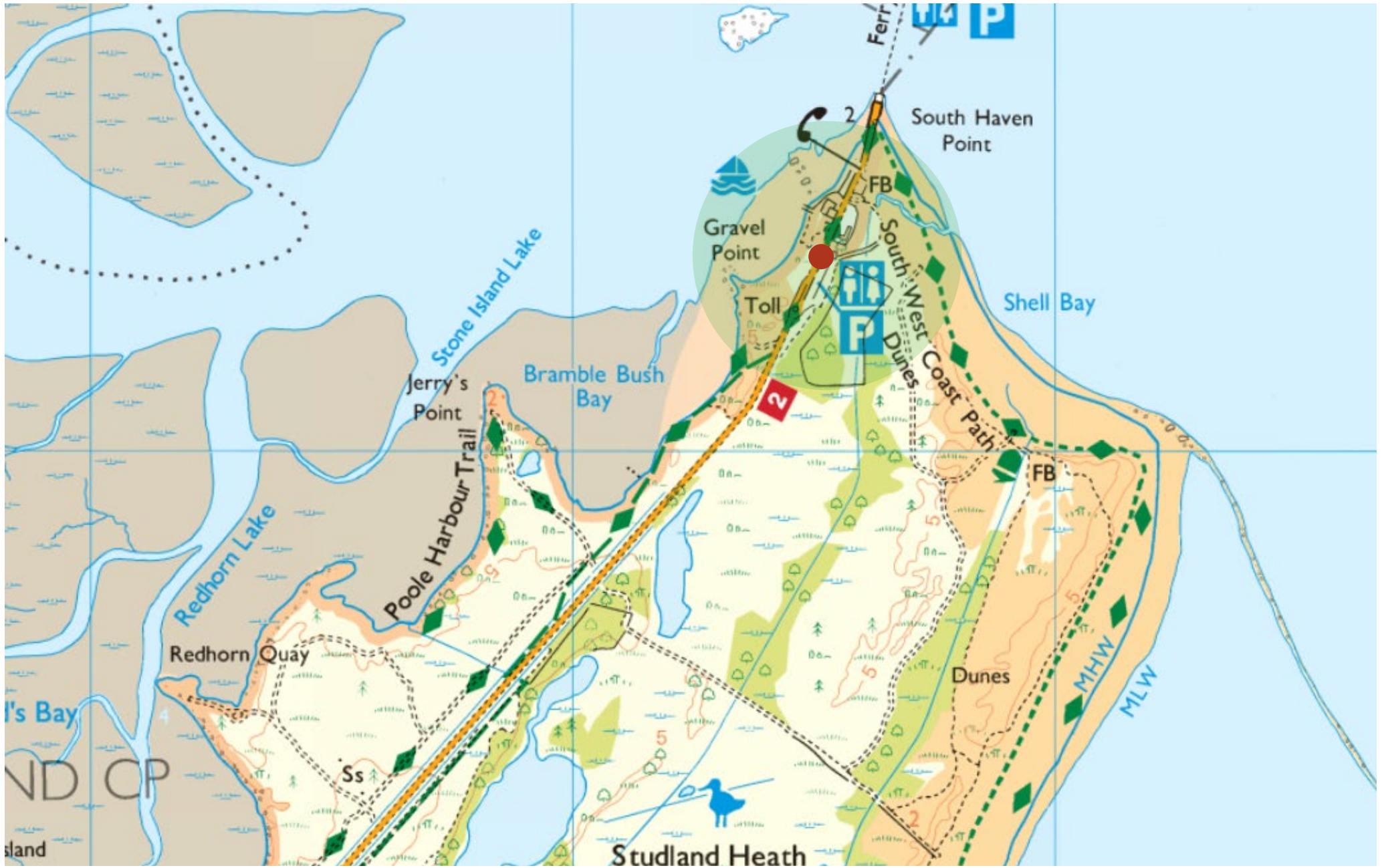
Turn point - Studland BH19 3BA Mile 84

Not signed. Only water and basic snacks available.