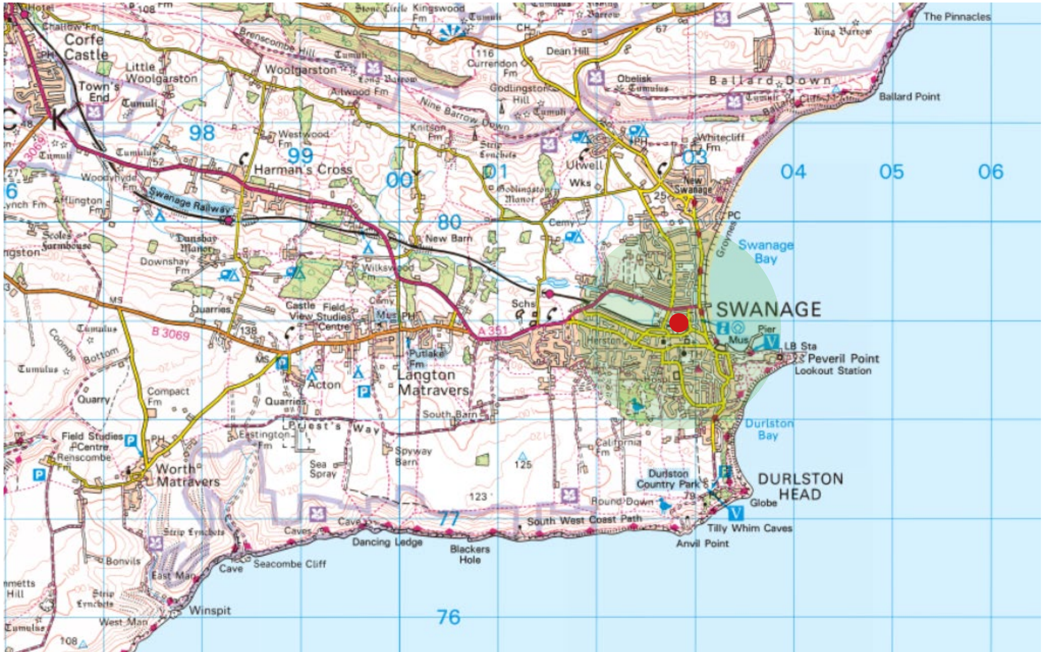
The loft Commercial Rd, Swanage BH19 1DF Mile 75 / 90